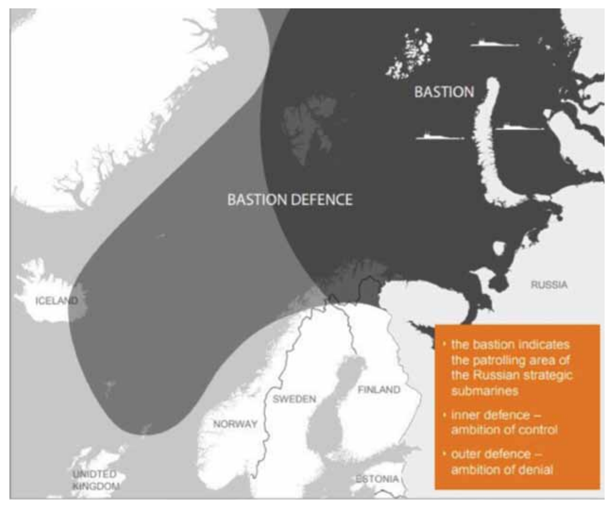
The Bastion Defence. Illustration from "Unified Effort", report of the Expert Commission on Norwegian Security and Defense Policy, 2015.

adversary the ability to threaten these capabilities, in part through offensive strategies of denial entailing deploying own assets and threatening or attacking adversary assets far beyond Russian territory. This is the reason Russia remains particularly sensitive about strategic assets operating in and based off Norwegian territory and about the carrying out of NATO reinforcements and operations in their immediate vicinity. This dilemma drove strategic operations in the North Atlantic during the Cold War – and it remains a key issue today. The necessity of strategic depth for the defense of the Kola Peninsula is deeply ingrained in Russian strategic thought and will not be easily swayed by Western deterrence.